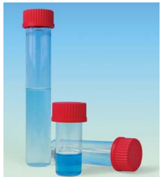
GL45 screwcap Bottles