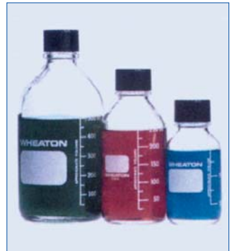
Media Lab Bottles