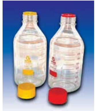
Colored Lab Bottles