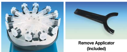
(3) Microtube Platform Head, 0.5-2.0ml Tube "PM310" (Optional)