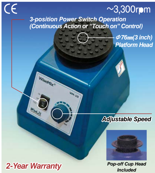
Multifunction Vortex Mixer Set "VM-10" with \phi 76mm(3") Platform (PM110)

DAIHAN-brand® Multifunction Vortex Mixer Set, "VM-10", Up to 3,300rpm, with Certi. & Traceability with \phi 76mm(3 inch) Platform Head & Pop-off Cup Head, Variable Speed Control, Continuous or Touch-on Mixing 다용도 볼텍스 믹서, 다양한 속도 조절, 강력하고 안정된 동작과 저소음