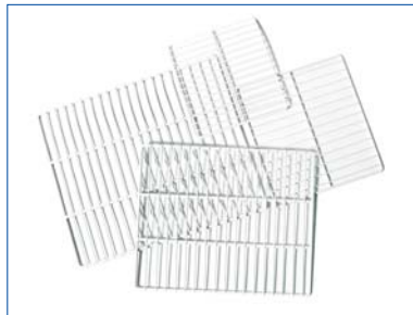
(1) PE-coated Steel Wire Shelves : included/Standard

* Other Specifications are available upon Customer's Request.