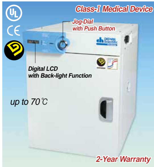
“ThermoStable™ IF-105”, Forced-air Incubator